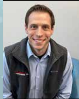
Skyler Vearrier Climate Control Inc