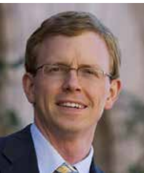
Dusty Johnson US Representative (R-SD)

Every state is a border state. South Dakota is no exception.