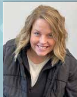
Molly Wood Plains Commerce Bank