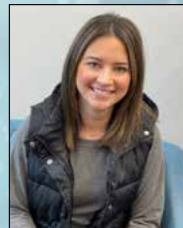
Lane Bauer Insurance Plus