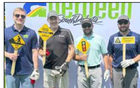
Flight 1, T 5th Place ReadiTech