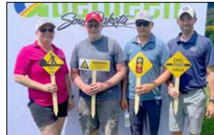
Flight 3, 7th Place Helms & Associates 2