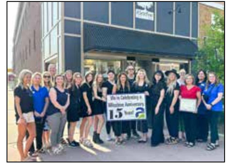
Revive Day Spa