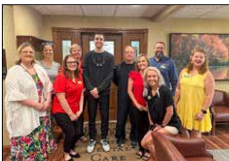
Carrels & Bain Family Dental Care