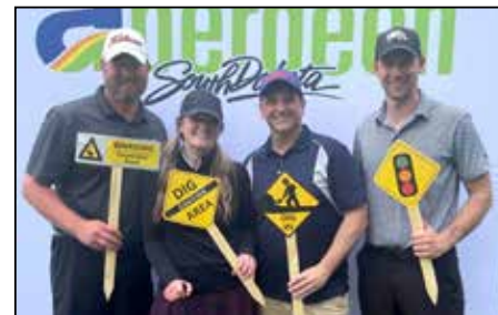
Flight 1, T 3rd Place Avera St. Luke's