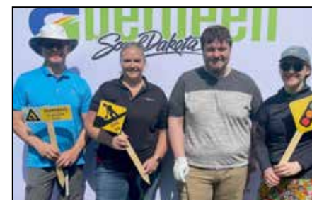
Flight 3, 10th Place 3M Company