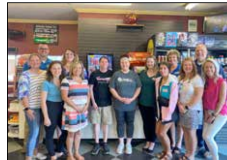
C-Express State St (Wolf Stop)