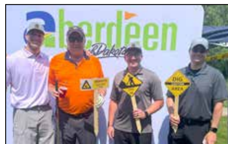
Flight 3, T 4th Place Plains Commerce Bank