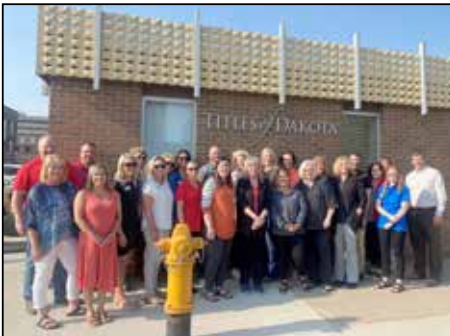
Titles of Dakota