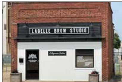
LaBelle Brow Studio 14 5th Ave SW