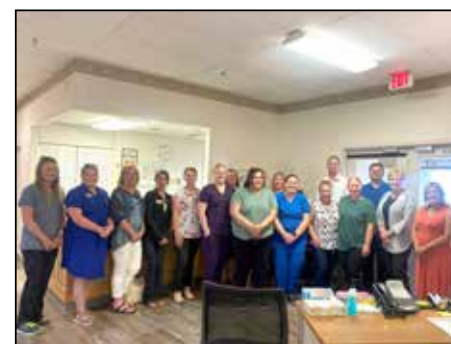
Prairie Heights Healthcare