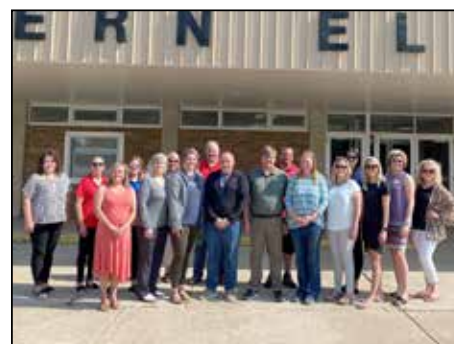
Northern Electric Cooperative