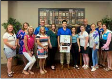
Aberdeen Area Arts Council

The revival of Chamber Week brought surprise visits to Chamber members chosen at random. Staff, board and committee volunteers packed the Lagers & Zoo Bar shuttle to drop off goodies and learn more about each business. We appreciate the hospitality shown at all visit locations!