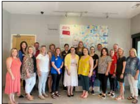
TownPlace Suites by Marriott