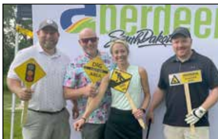
Flight 3, T 1st Place Blackout Industries