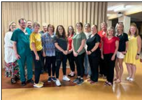
Avera Mother Joseph Manor