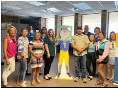
SDSU Extension Aberdeen Regional Center