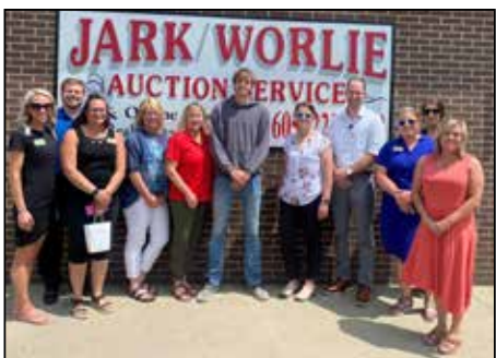
Jark/Worlie Auction Service