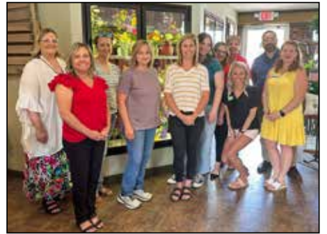
The Boston Fern