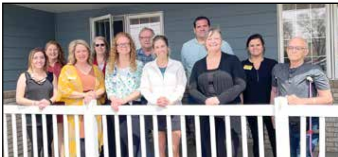
The Chamber's Health & Wellness Committee held their May meeting at Derian Place.