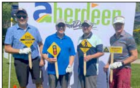
Flight 1, 1st Place US Bank

Chamber Week was revived in 2023 with the theme Summer Celebration: Road Trip to Aberdeen. To kick things off, 32 teams took to the links at MC3 on a beautiful summer day for a chance at prizes + bragging rights, as well as to celebrate being Chamber members in the Hub City. Thanks to all who participated, to our hole sponsors for making this possible and to the staff at MC3 for their five star customer service!