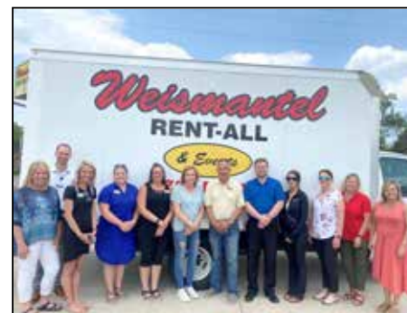
Weismantel Rent-All & Events