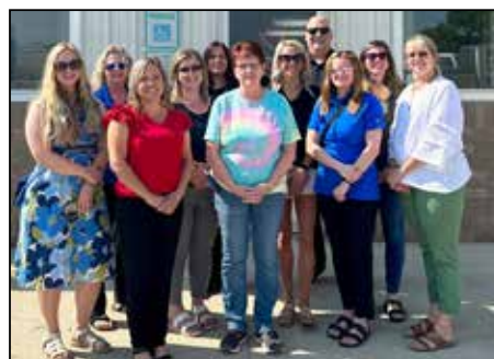
Jensen Rock & Sand