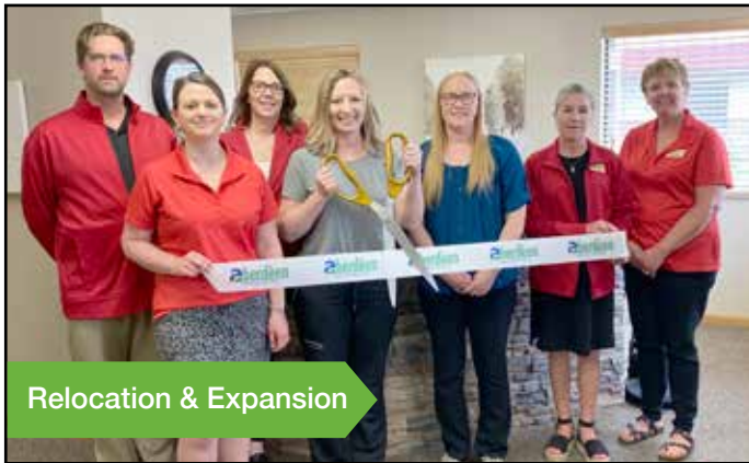
Relocation & Expansion