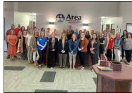
Area Federal Credit Union