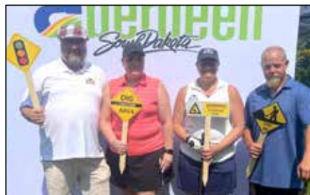
Flight 3, T 4th Place RAM Housing