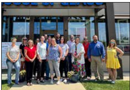
House of Glass