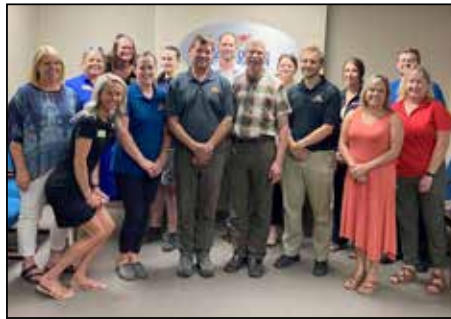
Aberdeen Parks, Recreation & Forestry Department