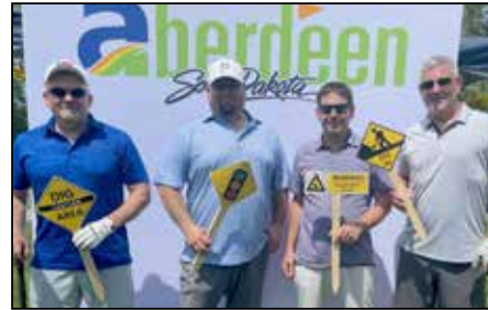
Flight 3, T 1st Place Interior Design Concepts