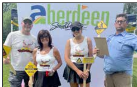
Flight 3, T 4th Place American Bank & Trust