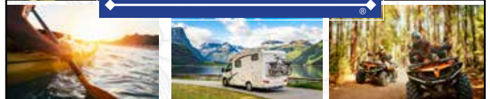
AUTO - MOTORCYCLE - MOTORHOME - BOAT - ATV - JET SKI - RV