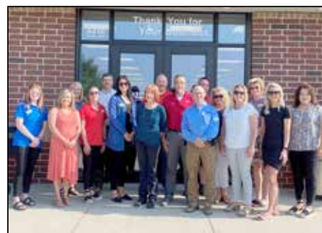
Karl's TV & Appliance