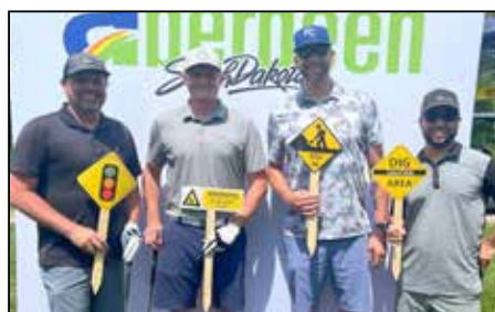
Flight 1, 9th Place New Friends