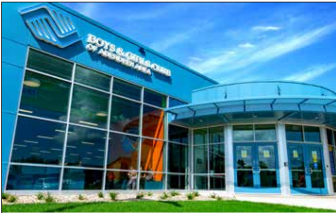
Boys & Girls Club - Aberdeen, SD

You Bring the Vision. We Bring it to Life.