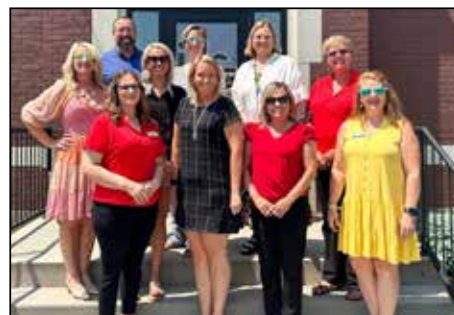
Interior Design Concepts