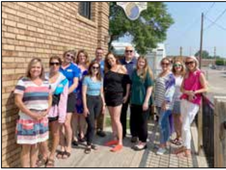
Profiling Beauty Health & Wellness Center