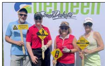
Flight 3, 9th Place SD Manufacturing & Technology Solutions