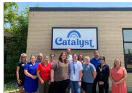
Catalyst Behavior Solutions