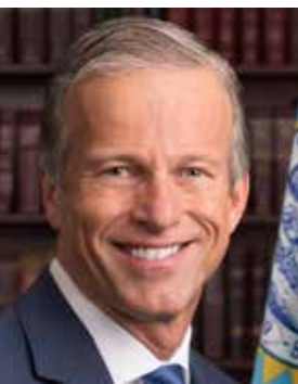
John Thune US Senator (R-SD)

Higher prices have become a fact of life during the Biden administration. This is especially true for energy – in South Dakota, the typical family is paying $112 more per month for energy since President Biden took office. At the same time energy prices are straining family budgets, government policies are straining the energy industry and making our energy supply less reliable. This is no coincidence; it's the predictable result of the policies President Biden has enacted over the last two and a half years.